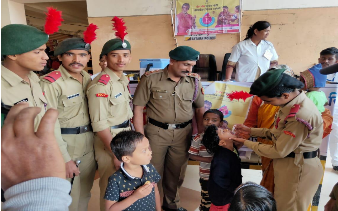
NCC Cadet taking Polio dose to babies